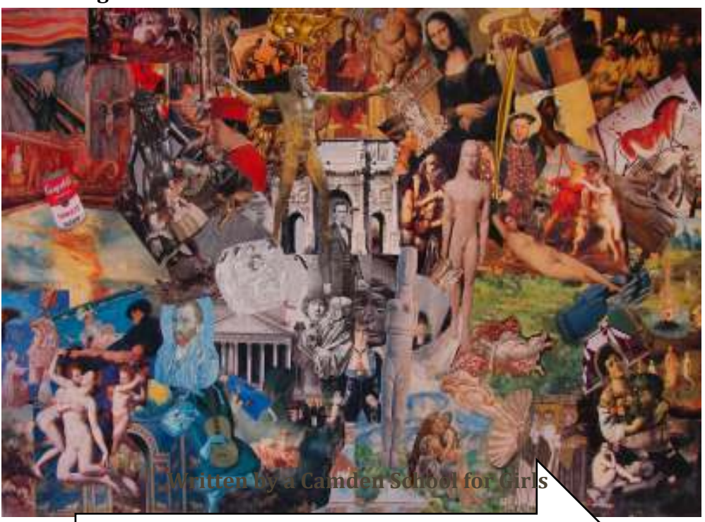
Year 13 student

Like all subjects – you want to learn! And what's better than learning about something you have a curiosity for and perhaps even have had an interest in from a young age. Doing History of Art is not just for Art students, although if you are an Art or a humanities student having history of art as a subject will definitely strengthen your love and understanding of art and culture! Throughout the two years you get to cover the history and meaning of many paintings, sculptures, buildings and much more!