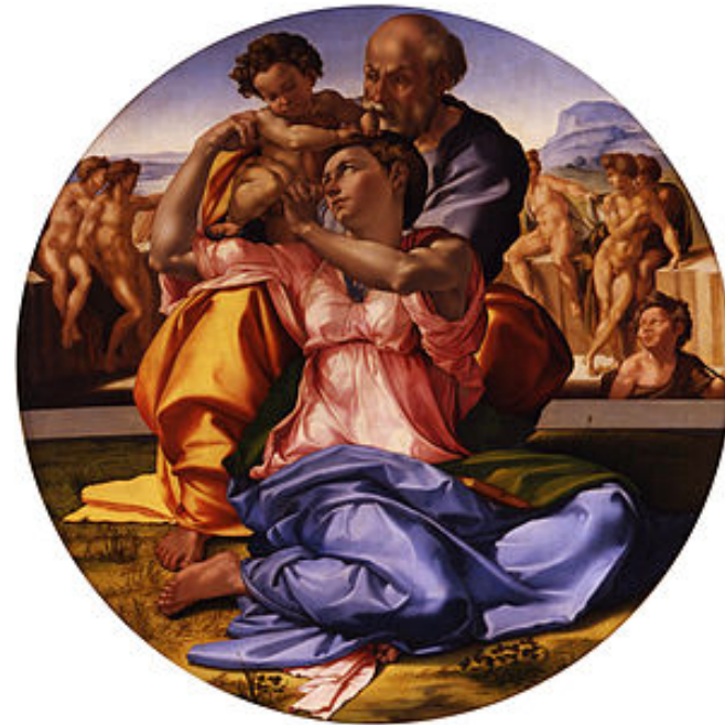
Doni Tondo Michelangelo 1507