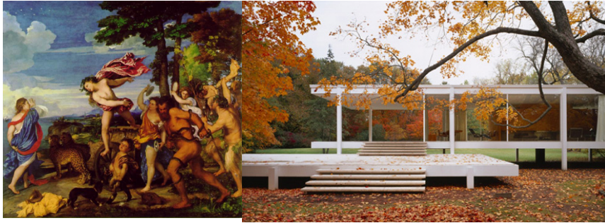
Titian Bacchus and Ariadne (1520-23). Farnsworth House designed and constructed by Ludwig Mies van der Rohe (completed in 1951) steel, concrete and glass.