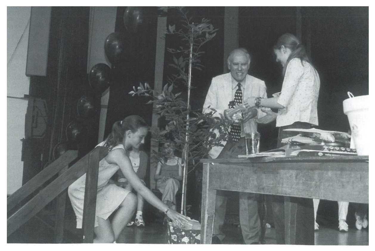
The last assembly and gifts galore!