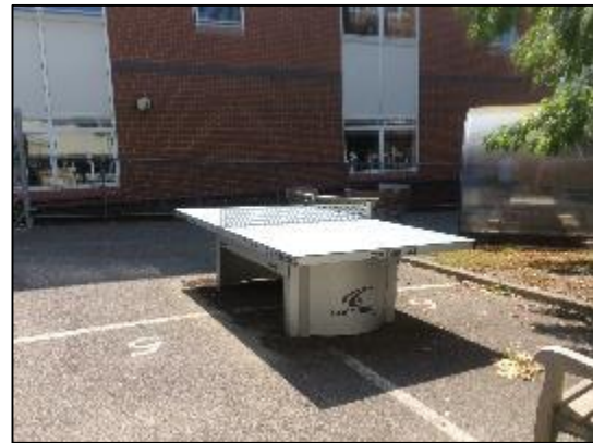
Table tennis, picnic benches, spinning chairs – so much to discover!