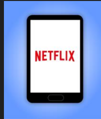
Watching movies on Netflix