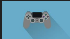
Online Gaming - (Roblox seems to be popular)