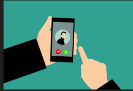
Video Calls to friends and family

71% of you are keeping entertained by using apps like TikTok - It's great to see so many of you are still singing and dancing away - Keep up the practise for the next talent show!