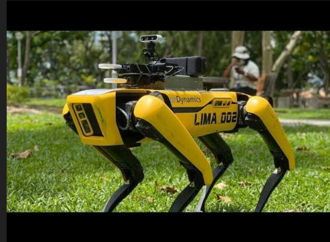
Coronavirus: Robot dog enforces social distancing in Singapore park

Thank you to the 157 students who responded to my survey before half term