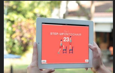
Many of you are keeping fit by using workout APPS