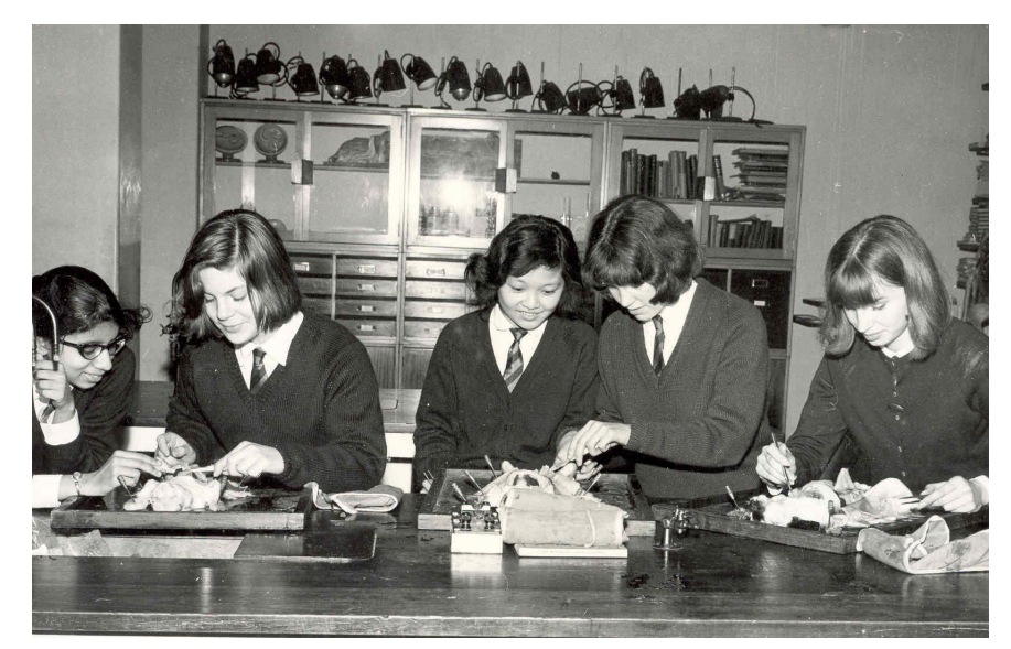
Animal dissection in Science.